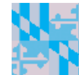
State of Maryland

While not a Founders’ Group member, the State of Maryland has appropriated $4.0 million in matching funds to date.