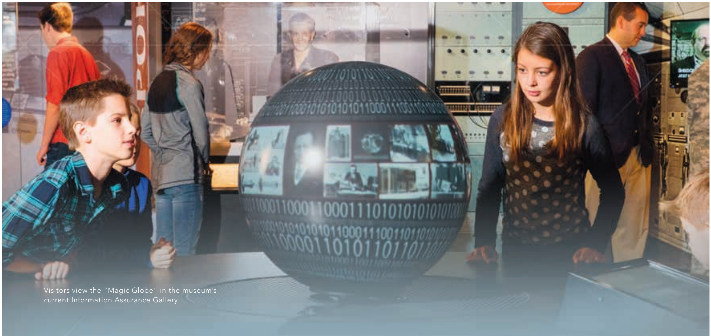
Visitors view the "Magic Globe" in the museum's current Information Assurance Gallery.