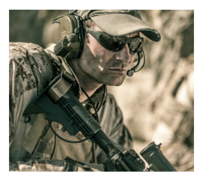
Jack Carr USN SEAL (ret.) "From the SEAL Teams to Novelist: Media as a Force Multiplier"