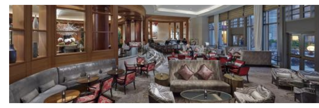
Enjoy post-evening networking and drinks in this 5-star hotel's beautifully appointed lounge.